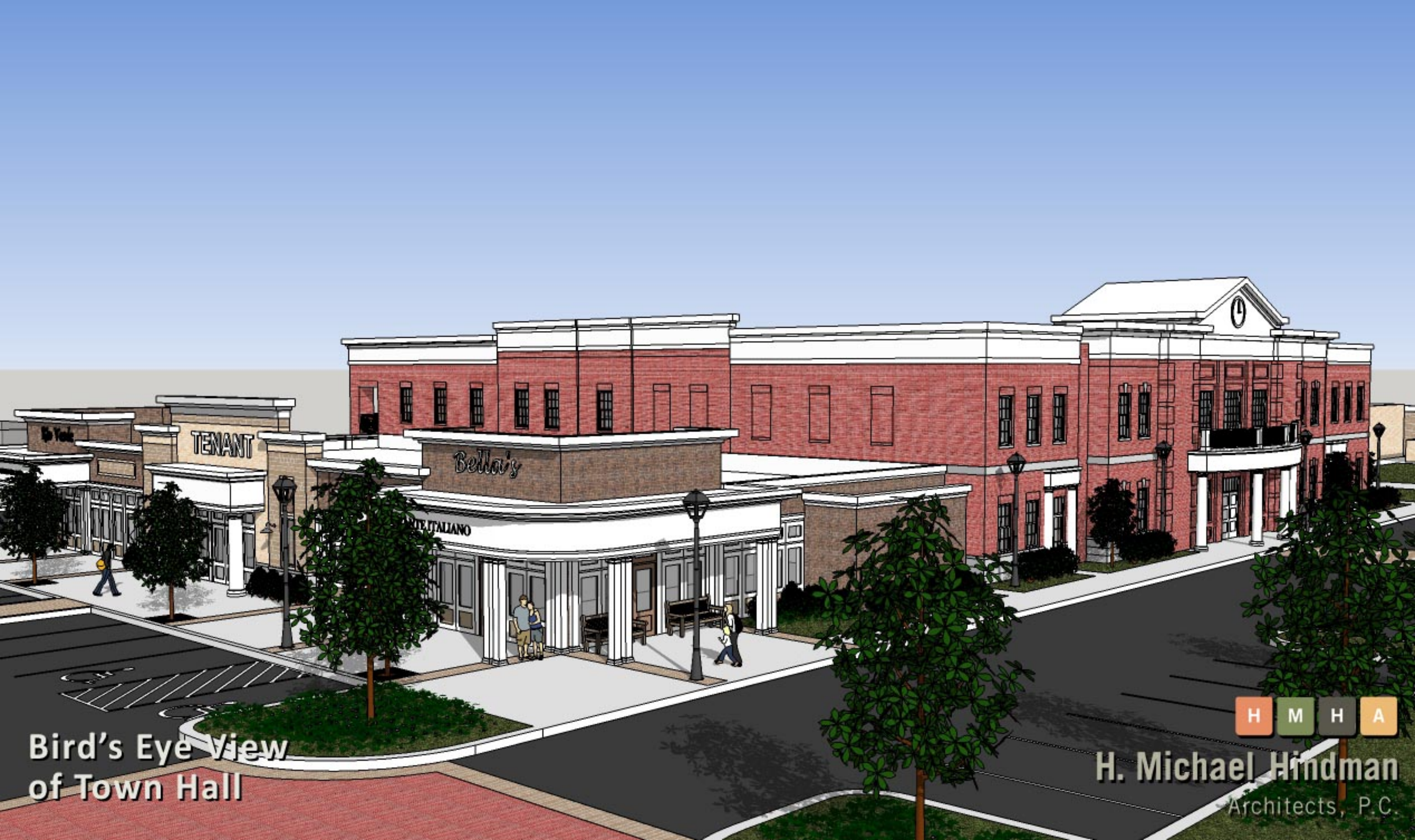
Bird's Eye View of Town Hall